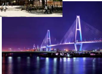
Night View of Meiko Triton