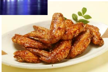
Tebasaki: deep-fried chicken wingtips