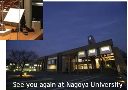
See you again at Nagoya University