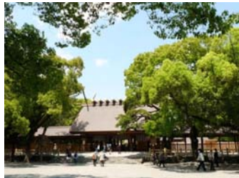
Atsuta Grand Shrine

To register, and to find continuously updated information, please visit our conference website at http://www.sfj.or.jp/interfinish2020.html