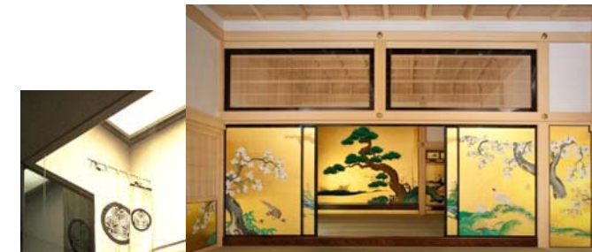
Tokugawa “Samurai” Museum

Plasma Center for Industrial Applications Nagoya Industries Promotion Corporation